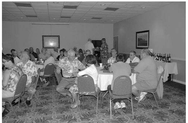
Eating again – Saturday night banquet