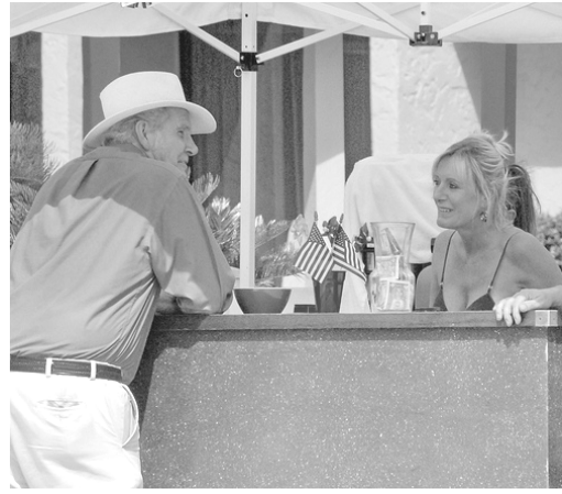
After a break for lunch, the fun began. The Holiday Inn Express has a beautiful, oversized swimming pool and with the addition of an outdoor