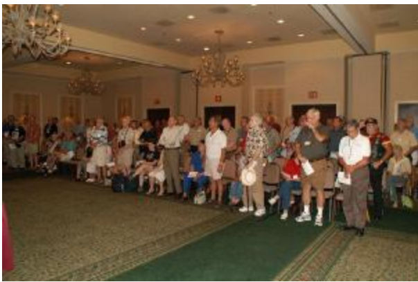
This was the official end to our reunion, though many remained for much of the day, reluctant to see it all end.