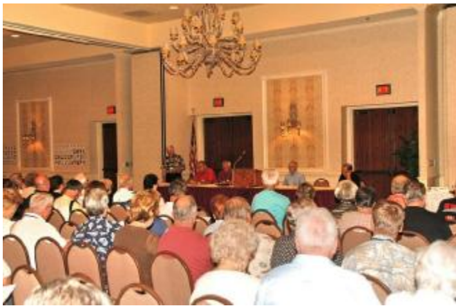
Taps was played to end our service.