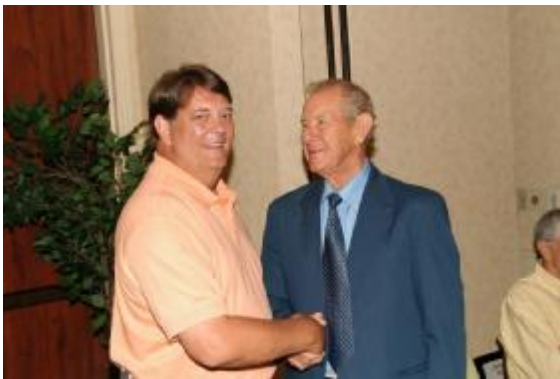
And then takes the floor to enjoy a favorite past-time.